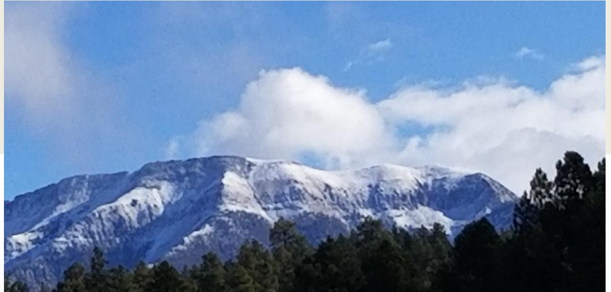
"How beautiful upon the mountains are the feet of the messenger who announces peace, who brings good news, who announces salvation, who says to Zion: "Your God Reigns." Isaiah 52:7