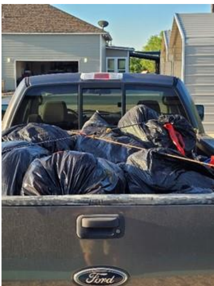
Over 20 bags of clothing and toys headed to the Diocesan World Missions Ministry.

St. Matthias continues to be active in outreach. Our congregation has been collecting clothing and other items for many months. The Hospice Thrift store and the Family Life Center were not accepting clothing donations because of COVID, so we were able to bring them to the Diocese for distribution to the refugees from the border and to bring to Navajo Nation. There were over 20 bags of clothing and children's toys and they were very well received! We are continuing to collect clothing and will continue to bring them to the Diocesan office for distribution. Thank you to everyone who continues to donate.